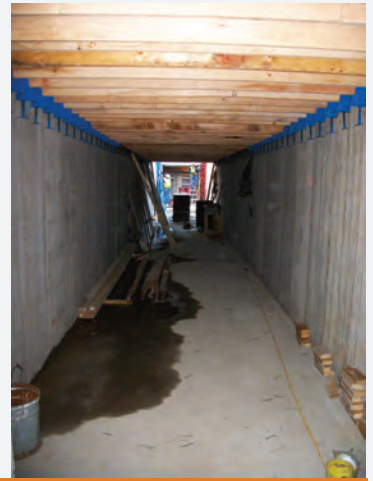
The top pictures show the construction process of the 2010 tunnel project and the bottom picture shows the completed tunnel with all of the mechanical and electrical components installed.