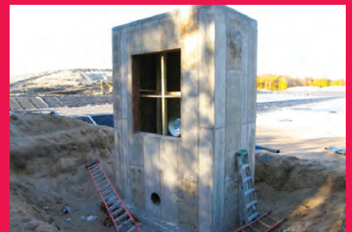
Leachate Vault At Wood Island Landfill Munising, MI