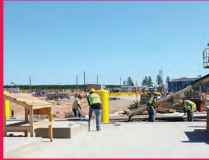
Concrete pavement and pouring of apron - Eagle Mine Site