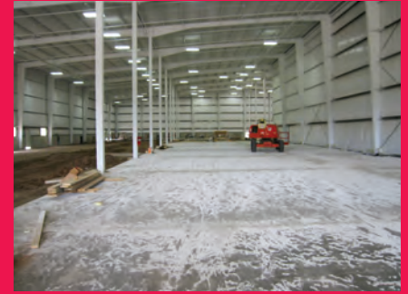
Poured concrete floor Pine River Saw Mill - Amasa, MI