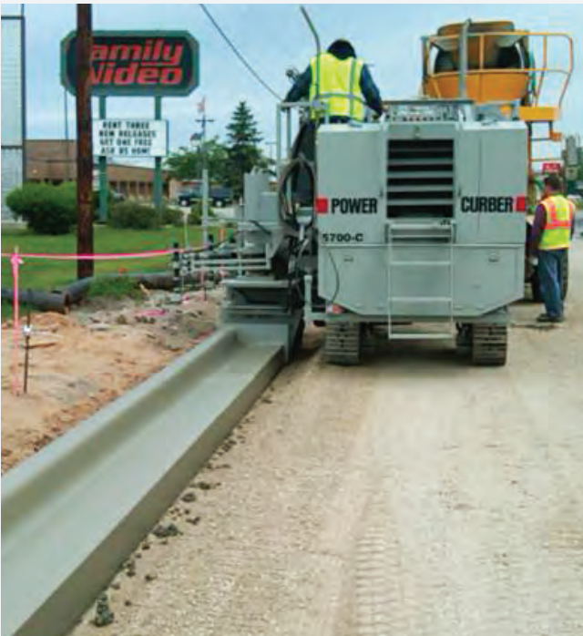
POURING CURB - MENOMINEE, MI