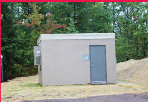
Eagle Mine Communications Building Big Bay, MI