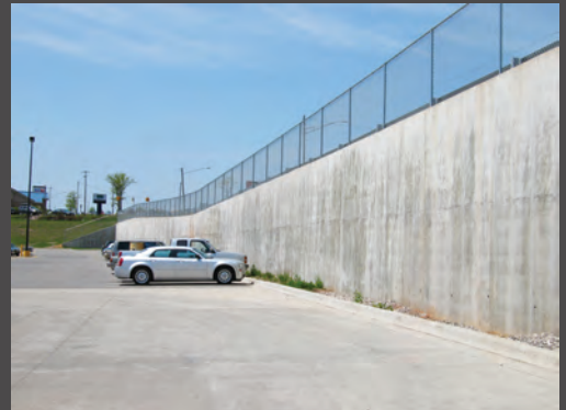
Wal-Mart Retaining Wall Iron Mountain, MI