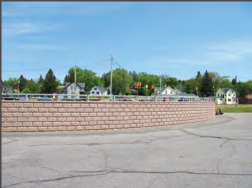
Super One Foods Retaining Wall Iron Mountain, MI

Pictures above show the Silver Lake basin splash wall formwork and finished product.