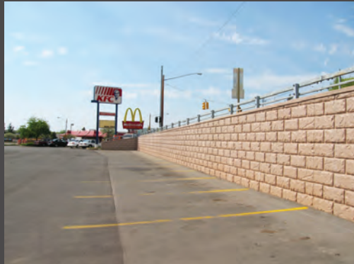
KFC Retaining Wall Iron Mountain, MI