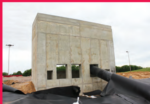
Leachate Vault At NewPage Mill Escanaba, MI