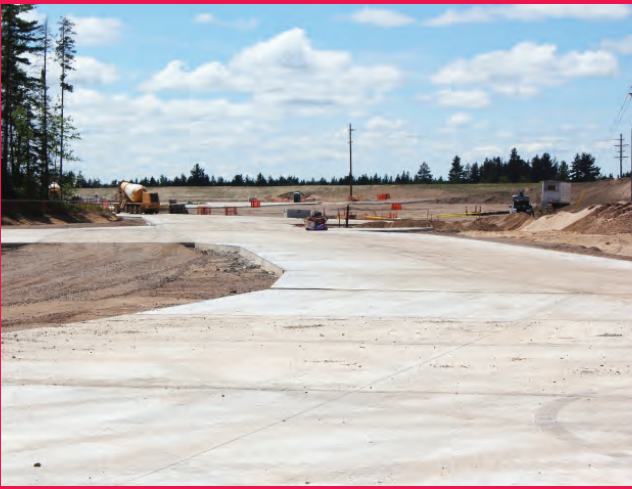
Concrete Pavement - Eagle Mine Site